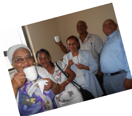
Enjoying a cuppa: Mothering Sunday