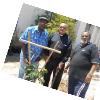
Tree Planting: French Centre