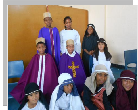
PASSION PLAY : GOOD FIDAY