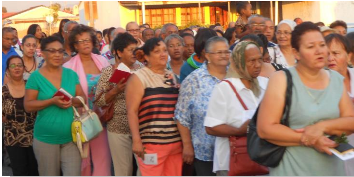
PALM SUNDAY – PROCESSION OF WITNESS