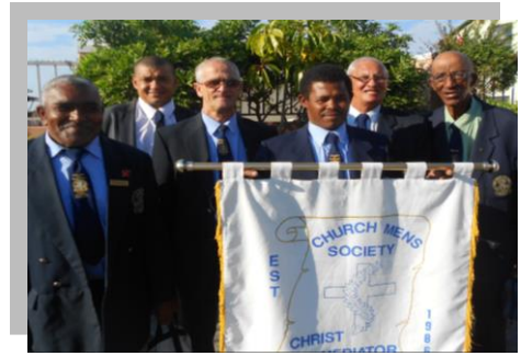
Church Men's Society